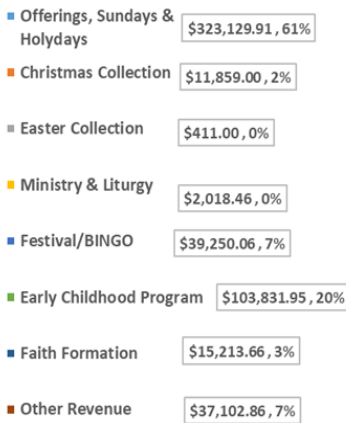
OPERATING INCOME JULY 1, 2019 thru March 31, 2020