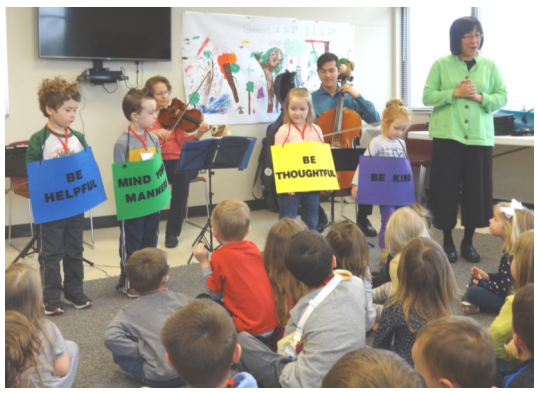
Visit from Dayton Philharmonic String Quartet