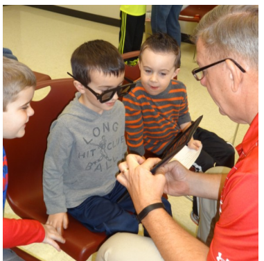
Free Eye Screenings